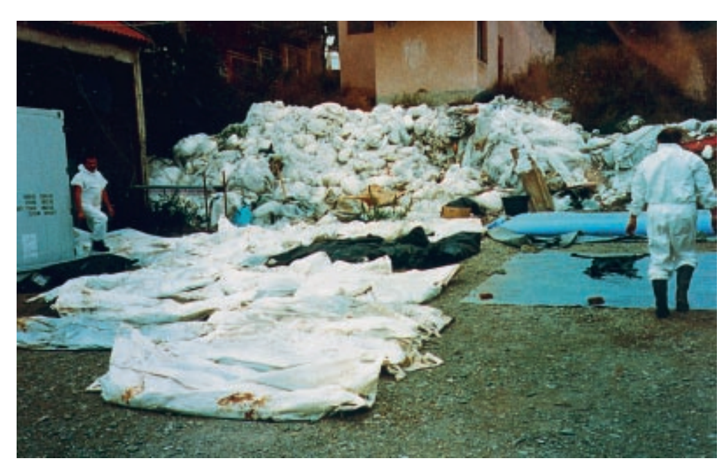
Around 30 bodies from a mass grave close to Orahovac (approx. 20 kilometres north-east of Prizren). In this area around 850 bodies have been exhumed, in some cases horribly mutilated. This picture was taken on 11 September 1999, the crimes committed in late March 1999.