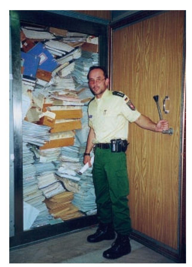
A record of human suffering piled up in a safe of the present UNMIK station in Prizren. The German police found files left behind by their predecessors and realised that "until now nobody has bothered to read them".

For instance: German police personnel are now prohibited from using the facilities of the German Bundeswehr. They may now no longer telephone or shop or dine at these centres, although formerly