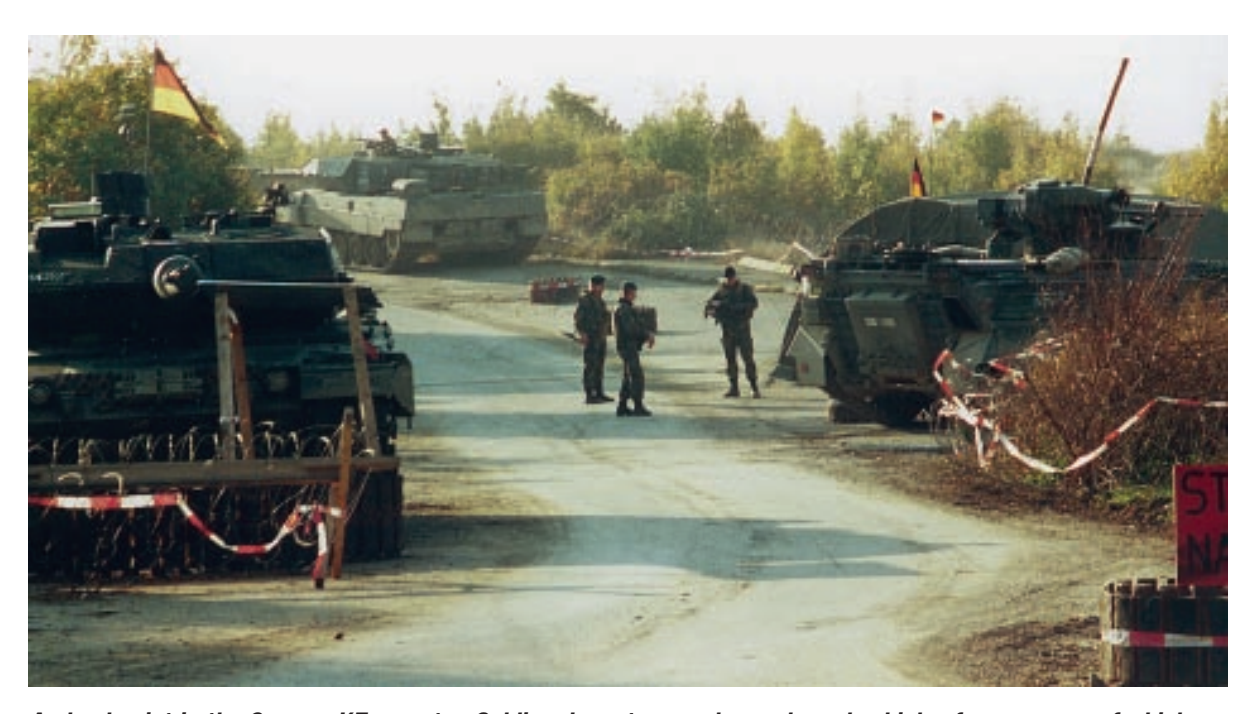
A checkpoint in the German KFor sector. Soldiers have to search people and vehicles for weapons, of which a large number are still in the hands of the civilian population.

The refuse attracts stray dogs, both famished and overfed mangy brutes. One does not even dare guess how and what they find to feed. All over Kosovo the streets are strewn with dead dogs, fresh