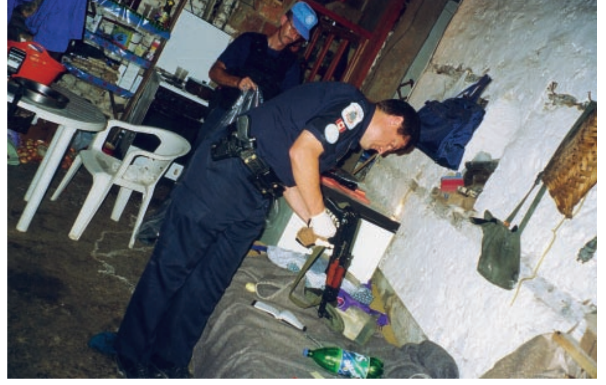
Examination of weapons found on a suspect by UNMIK personnel from the United States and Canada.