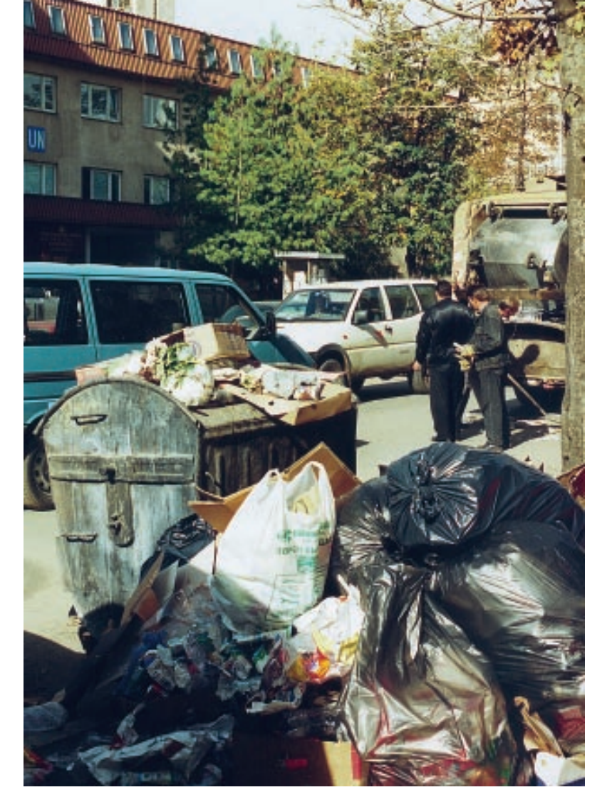
Piles of rubbish accumulate everywhere on the streets of the towns and villages of Kosovo, as here in Pristina. Whenever they block the way they are simply set on fire. The smell of fire hangs over every district and town.

Later, in Pristina, we get a feeling of the situation following a total collapse of all civil administration: the entire city is covered by a pungent smell of burning. Everywhere you see burning heaps of refuse, scorch marks creep up the walls of houses. But what else can these people do, since nobody is prepared to pick up the garbage? Our reluctance to inhale is heightened by the presence of a coal-fired power plant discharging its exhausts into the air without any filter. So this is where our colleagues have to stay for six months?